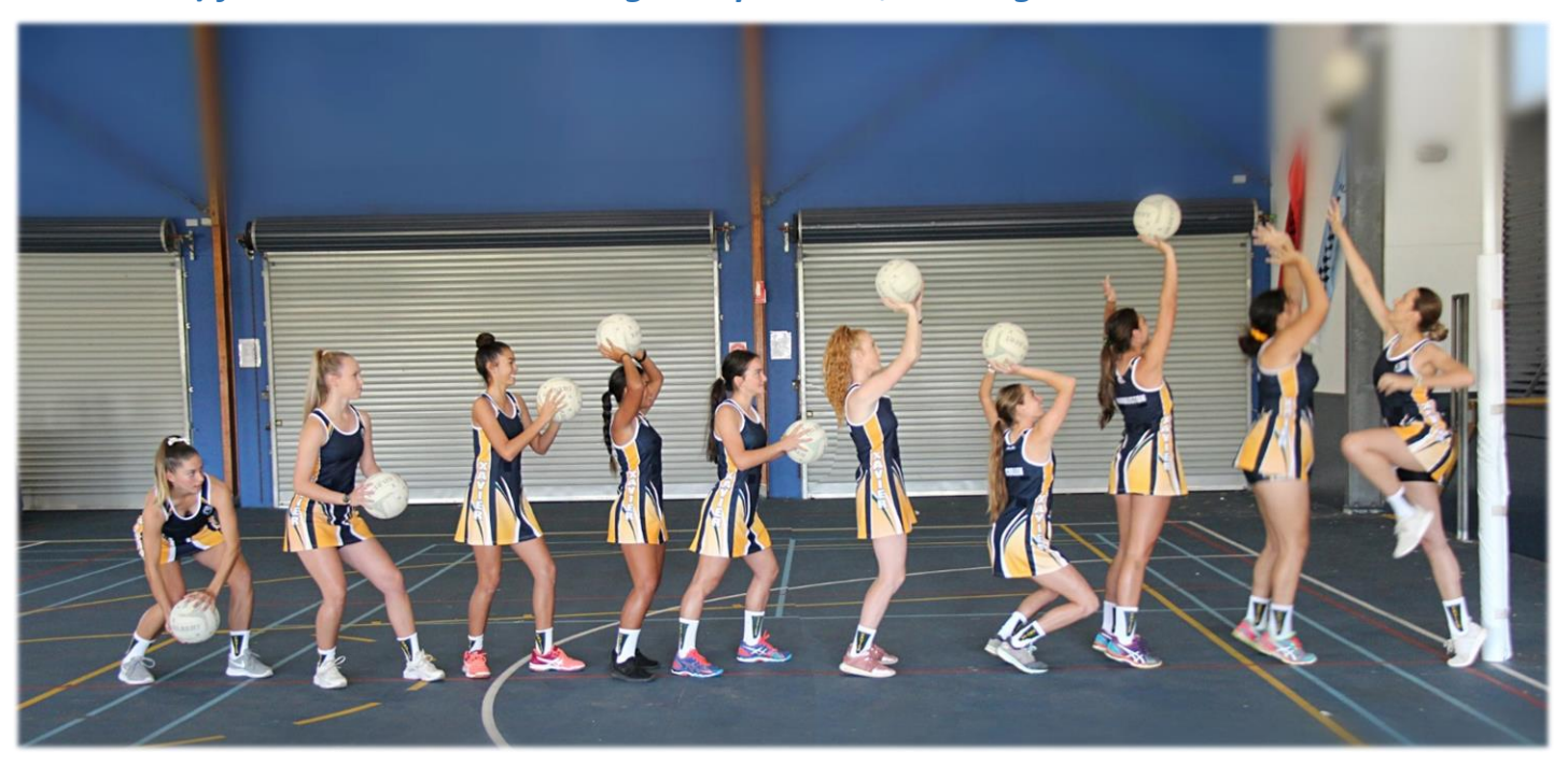
2017 Xavier QISSN Netball Team

Click on the hyperlinks above to view sport-specific information sheets (Appendix 3) for more details including: competitions, training and estimated costs.